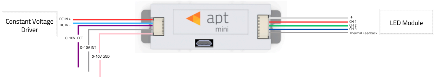
Figure 1 – APT3-VD-M2 Wiring Diagram

Thermal Feedback: Equipped with a smart temperature sensor system, the controller gradually adjusts current to regulate temperature, preventing overheating and ensuring stable operation and component longevity. Only use with Arkalumen's integrated thermal feedback LED modules, otherwise leave thermal feedback unconnected.