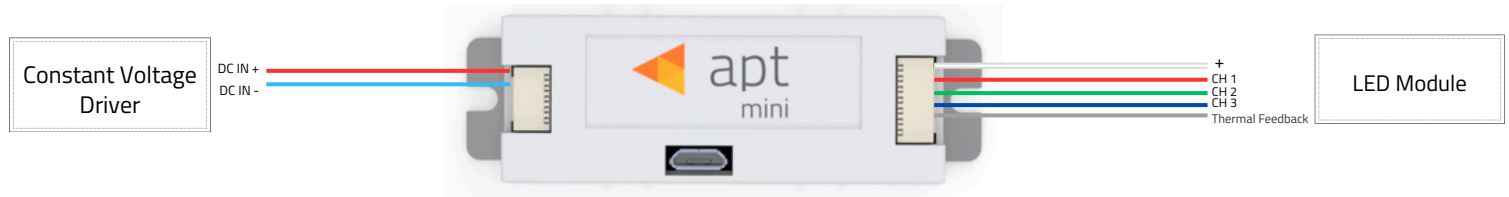
Figure 1 – APT3-VWC-M2 Wiring Diagram

Thermal Feedback: Equipped with a smart temperature sensor system, the controller gradually adjusts current to regulate temperature, preventing overheating and ensuring stable operation and component longevity. Only use with Arkalumen's integrated thermal feedback LED modules, otherwise leave thermal feedback unconnected.