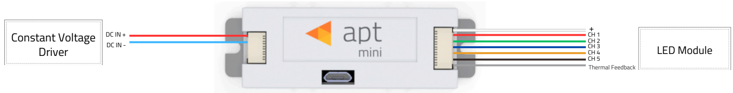
Figure 1 – APT5-VWC-M2 Wiring Diagram

Thermal Feedback: Equipped with a smart temperature sensor system, the controller gradually adjusts current to regulate temperature, preventing overheating and ensuring stable operation and component longevity. Only use with Arkalumen's integrated thermal feedback LED modules, otherwise leave thermal feedback unconnected.